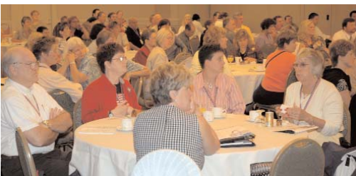
First Time Attendee / New Member Breakfast

According to Fodor's travel guide, "In general, the most visited city in Texas draws 3 types of tourists: Texans who come to shop and sightsee; conventioners; and visitors from northern Mexico, especially during Christmas and Holy Week." (source: http://www.fodors.com/miniguides ). This week, more than 1,000 conventioners have preregistered for AHRA's 33rd Annual Meeting & Exposition.